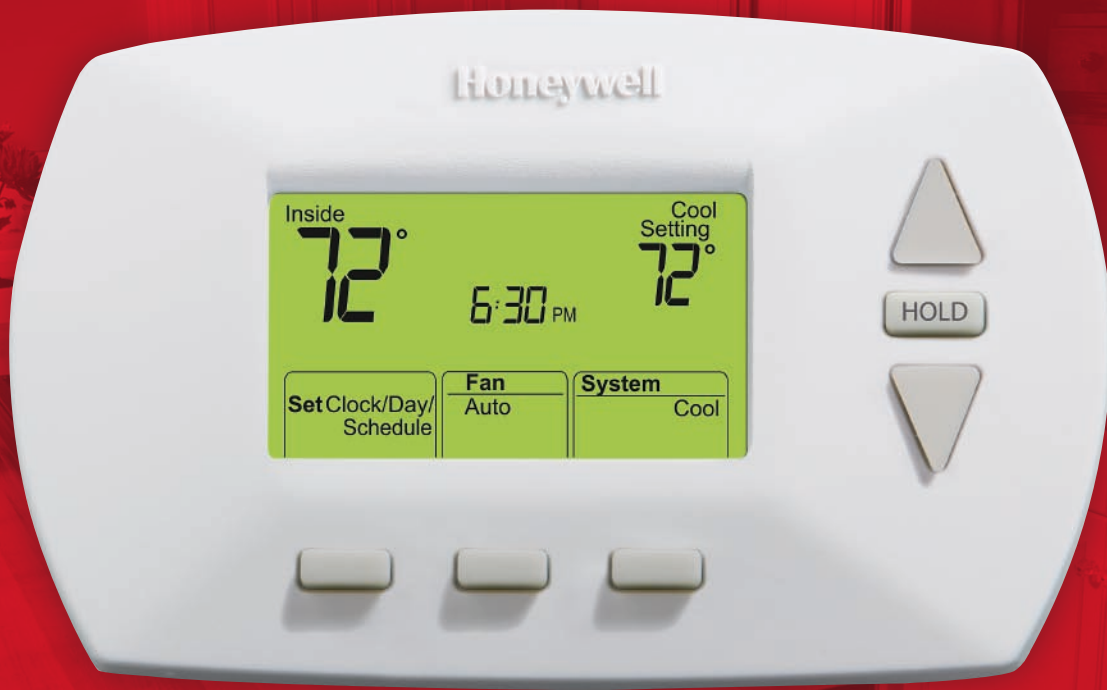
RTH6300B 5-2-Day Deluxe Programmable Thermostat